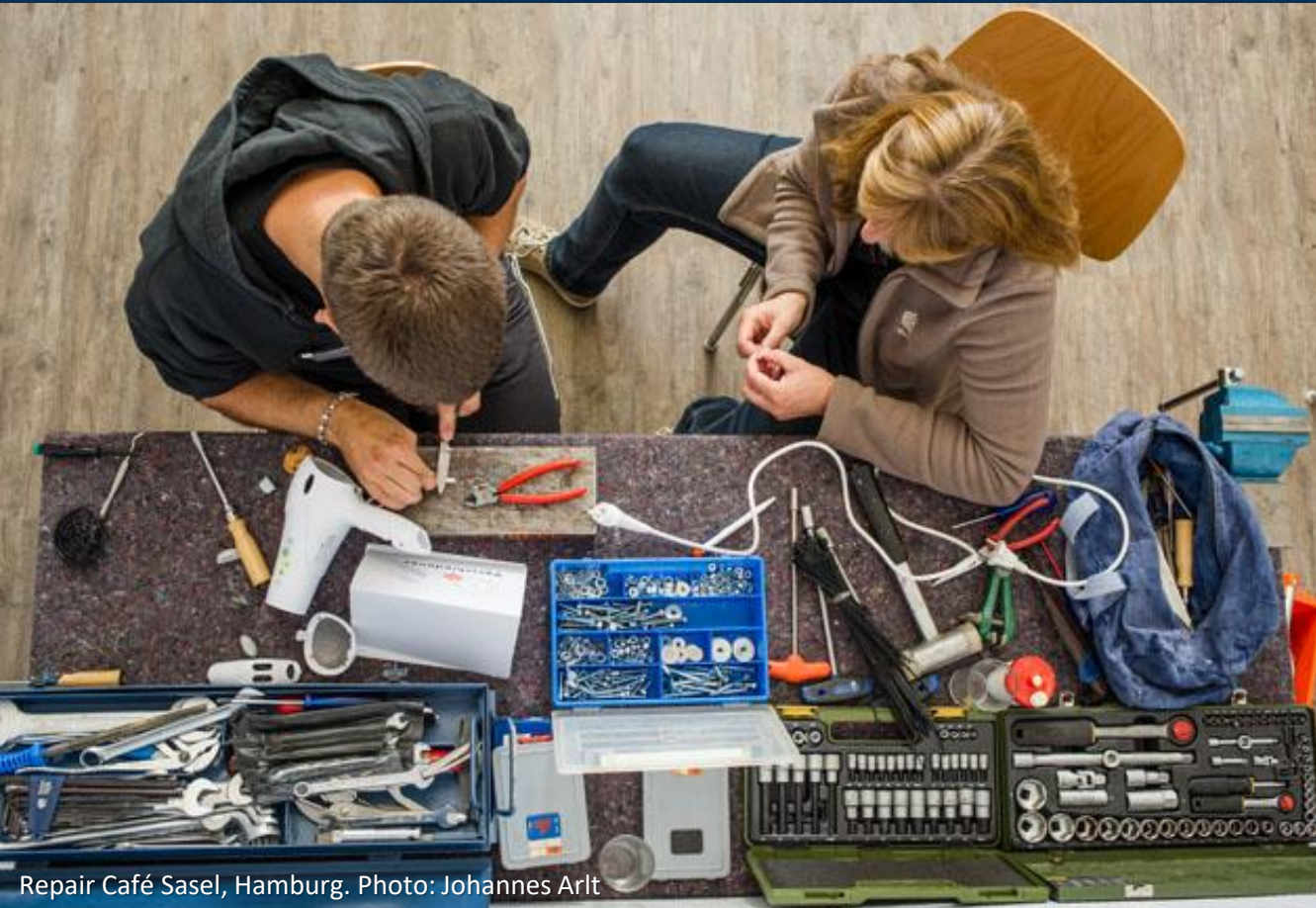
Repair Café Sasel, Hamburg.